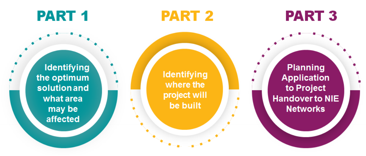
Figure 2.1: SONI's Grid Development Process

The planning of grid development projects by SONI is done under a three part process (Figure 3.1). Asset replacement projects are progressed separately by NIE Networks. The process includes for stakeholder and public participation in the development of projects.