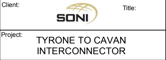
FIGURE 1.2: ADDITIONAL VISUAL RECEPTOR LOCATIONS DETAILED 500m STUDY AREA TOWERS 80-87 (SHEET 16 of 21)

This material is based upon Crown Copyright and is reproduced with the permission of Land & Property Services under delegated authority from the Controller of Her Majesty's Stationery Office, © Crown Copyright & database rights FLA213. Unauthorised reproduction infringes © Crown Copyright and may lead to prosecution or civil proceedings