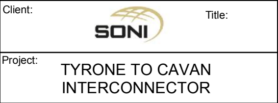
FIGURE 1.2: ADDITIONAL VISUAL RECEPTOR LOCATIONS DETAILED 500m STUDY AREA TOWERS 43-49 (SHEET 9 of 21)

This material is based upon Crown Copyright and is reproduced with the permission of Land & Property Services under delegated authority from the Controller of Her Majesty's Stationery Office, © Crown Copyright & database rights FLA213. Unauthorised reproduction infringes © Crown Copyright and may lead to prosecution or civil proceedings